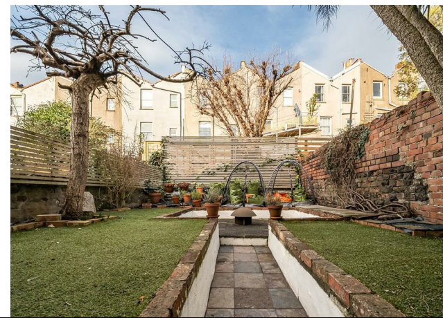
Windsor Terrace, Totterdown